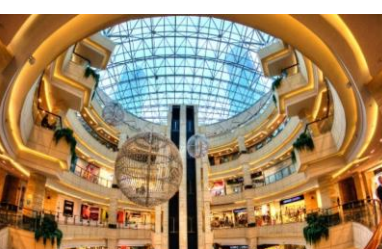
Shopping Mall/Gov building

As an unattended solution, Pilot Scout requires no daily management or specialized network expertise, making it an ideal choice for businesses of any size.