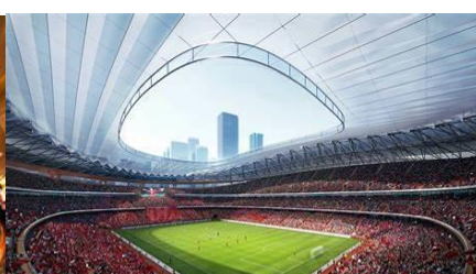
Large event venue