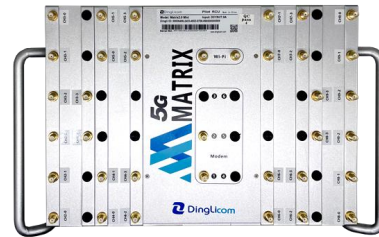
Pilot Matrix Mini supports simultaneous test \leq 8 UEs