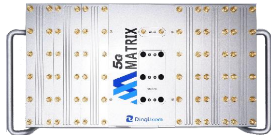
Pilot Matrix supports simultaneous test \leq 12 UEs

Pilot Matrix supports Qualcomm X55, X65, and X75 chipset-based 5G SA/NSA/RedCap test modules, enabling comprehensive benchmarking across various network technologies, operators, and device brands in a single drive test. Integrated with the cloud-based Fleet Edge platform, it allows engineers to manage, control, and monitor tests remotely in real time.